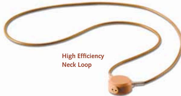
High Efficiency Neck Loop