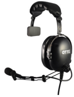
Heavy Duty Single Ear Cup