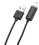
USB Replacement Cable