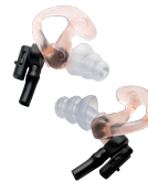
SureFire Ear Piece Upgrade For Hurricane