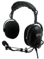
Heavy Duty Dual Ear Cup