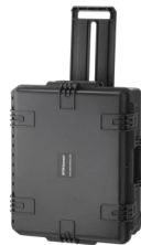
Large Case Holds 8