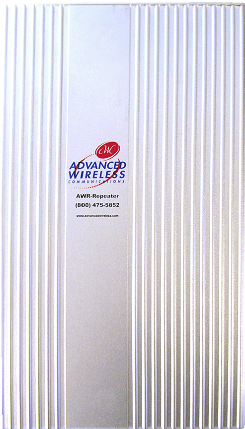
922963 AWC Repeater

The AWR-RP9000 Repeater extends radio coverage for greater range of portable two-way radios and other devices using radio frequencies.