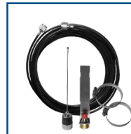
Non-Plenum Indoor Antenna 221357