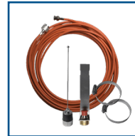
Plenum Indoor Antenna Kit 221356

Contact us for Information on cabling, antennas and additional accessories.