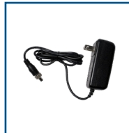
Power Supply 221287

The Telephone Interconnect is ideal for connecting a standard telco line, or an analog PBX extension to a repeater.