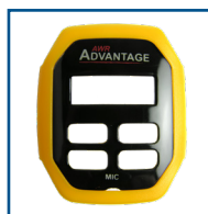
Yellow Faceplate 221060