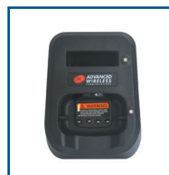
Single Unit Charger 221052