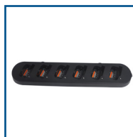
Six Unit Charger 221053