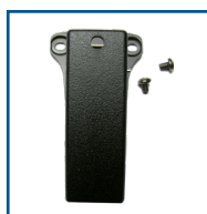
Belt Clip 221049