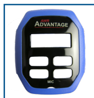
Blue Faceplate 221057