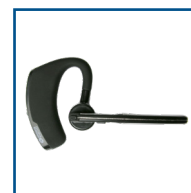
Traditional Bluetooth Headset 221126

Additional accessories including wired headsets are available at: www.advancedwireless.com