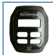
Black Faceplate 221054