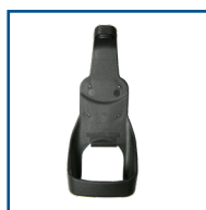
Holster Belt Clip 221115