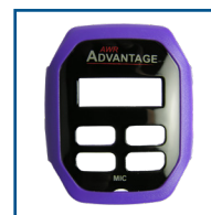
Purple Faceplate 221058