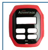
Red Faceplate 221055