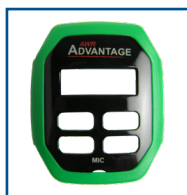
Green Faceplate 221056