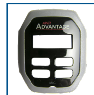
Silver Faceplate 221059