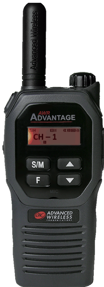
AWR Advantage Plus (with holster & battery) 106094