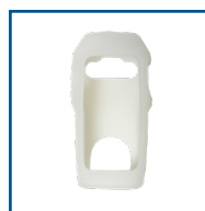
Rubber Sleeve 221050