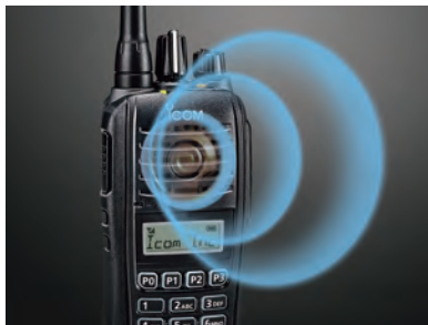
1500 mW powerful audio