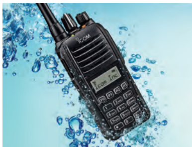
Waterproof for 30 minutes in one meter depth of water