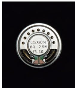
Icom custom high power handling capacity speaker